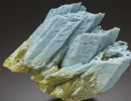
Plumbogummite on Pyromorphite Yangshuo Mine, Guangxi Prov. China

LLD Productions, Inc., P.O. Box 665, Bernalillo, NM 87004, Fax: (303) 223-3478, mzexpos@gmail.com www.mzexpos.com facebook.com/mzexpos